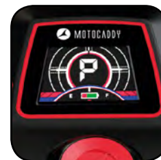
Fig 1 - M1 DHC

To release the parking brake, press the on/off button to start the trolley.